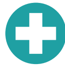
PART B Medical Insurance