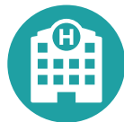
PART A Hospital Insurance